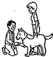
Exercise 4 ◆ Appearance and Grooming Animal may change position