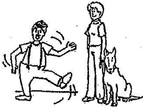
Exercise D Staggering, Gesturing Assistant staggers, then moves normally to pet animal