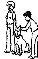
Exercise 3 Accepting Petting Animal may change position