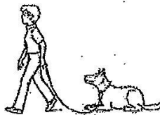
Exercise 10 ◆ (med./large dogs) Stay in Place 10 ft line with a 2-3 second pause