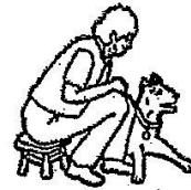
Exercise C ✦ Restraining Hug