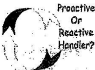
Exercise J ✦ Overall Assessment

The team should: > Be reliable > Be predictable > Be controllable