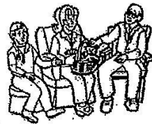
Exercise 8 and 9 (small dogs/cats) Animal Passed to 3 Strangers