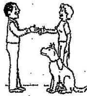
Exercise 2 ◆ Accepting a Friendly Stranger Animal may change position