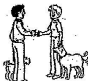
Exercise 12 Reaction to Neutral Dog