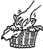
Exercise B ✦ Clumsy Petting