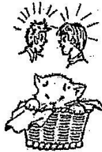
Exercise E Angry Yelling Assistant yells, then calms down and calls animal