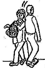
Exercise F Bumped from Behind