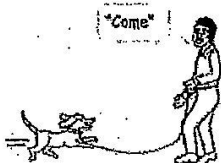
Exercise 11 Come When Called All dogs must do